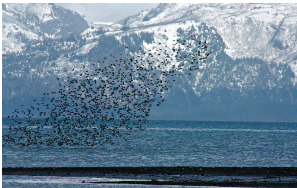
A flock of Rock Sandpipers flying over the Mid Spit area, Kachemak Bay, Alaska. A couple of thousand Rock Sandpipers overwinter at Homer Spit and begin departing when spring migrant shorebirds start arriving. The Rock Sandpipers often forage in Mud Bay.